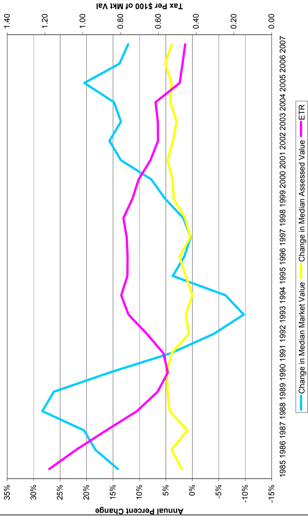
Chart 1: One-, Two-, and Three-Family Houses Market Value and Assessment Changes and Effective Tax Rate